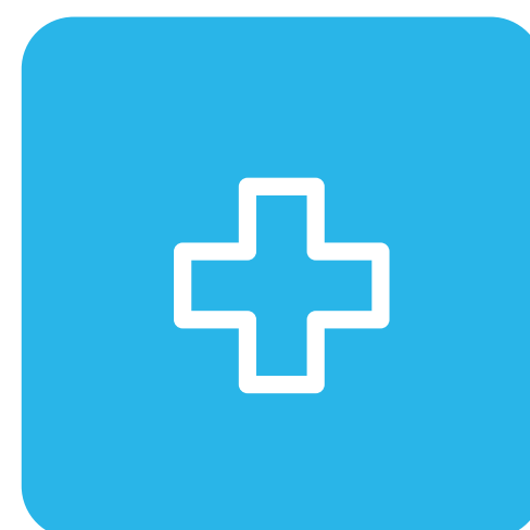
Healthcare and Life Sciences