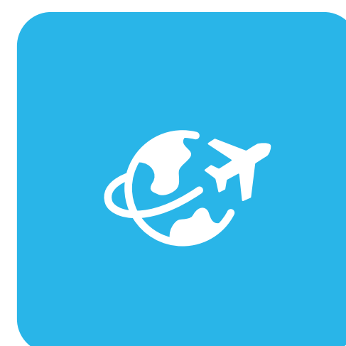
Travel and Hospitality